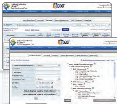
VISUAL WORK BREAKDOWN STRUCTURE