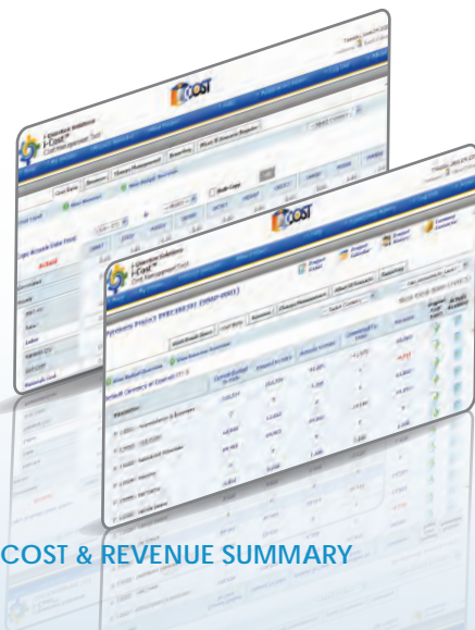
COST & REVENUE SUMMARY